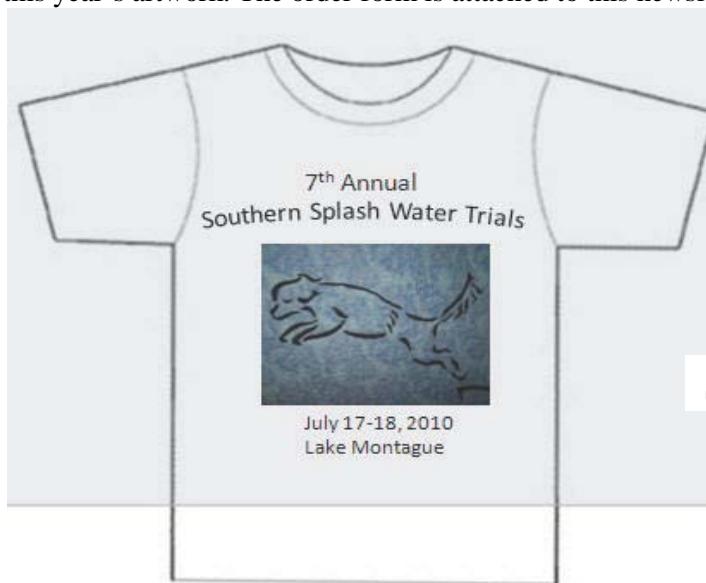
Shirt # 1

This year there will be two T-shirt styles to choose from –one with dates and one without. Only style #2, without dates, will be available if you wait to buy your shirts at the trials. All shirts will be unisex sizing and are 100% cotton. A big thanks to Diane Browning for providing this year's artwork. The order form is attached to this newsletter.