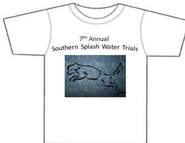
Shirt # 2