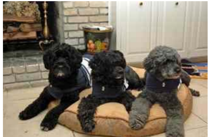
Skipper, Sassy and Bo in their Thundershirts send regards from sunny Florida!

Another method we use is to add a t-shirt (small, appropriate sized t-shirt) underneath the body wrap. This feels different than the Thundershirt and for dogs who have a fear of Velcro it is a good alternative. What I like about the Thundershirt versus the t-shirt is that the Thundershirt fits the dog well and it won't get caught on anything if your dog is running or walking around the house.