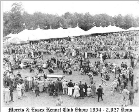
Morris & Essex Kennel Club Show 1934 - 2,827 Dogs